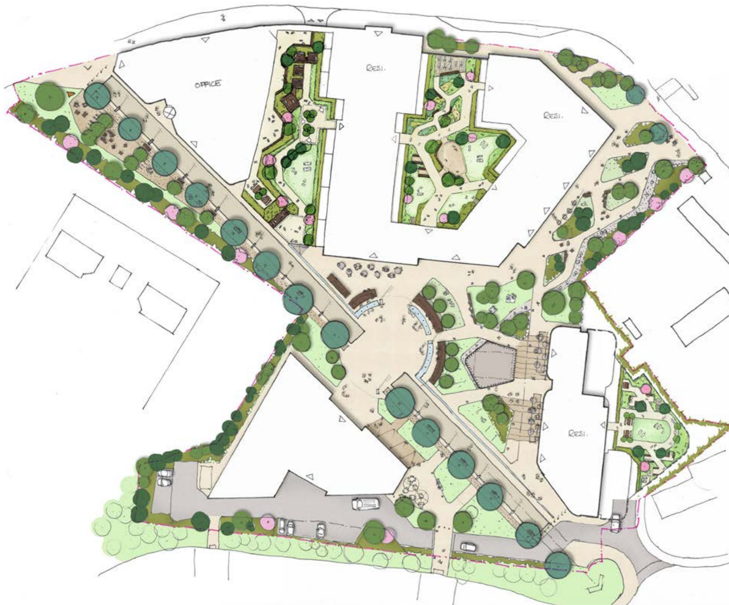
The site masterplan, showing all the open spaces and green corridors that would be created in The Maritime Gateway