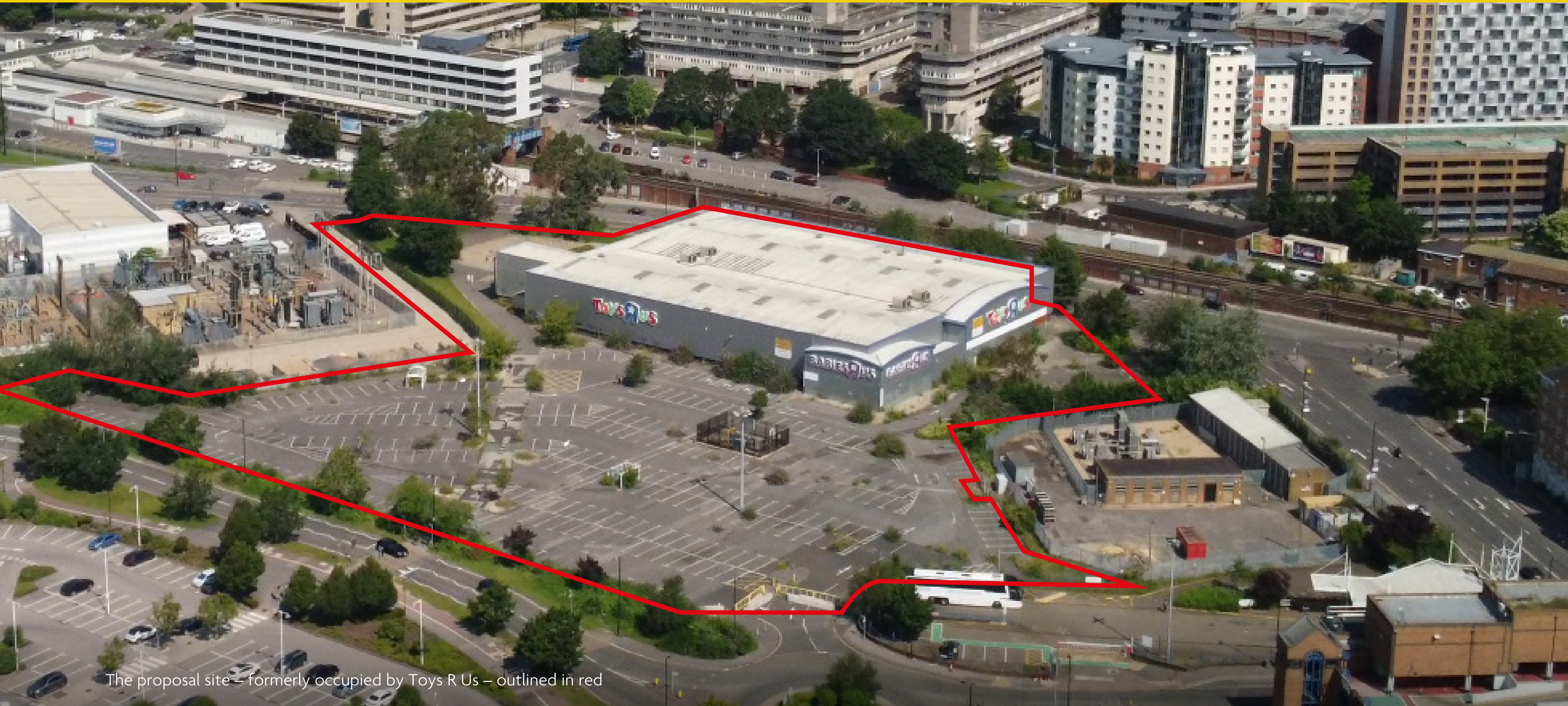
The proposal site – formerly occupied by Toys R Us – outlined in red